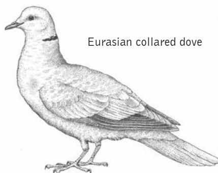
Eurasian collared dove

Eurasian collared doves resemble mourning doves but possess a black slash across the back of their necks. There is no limit on Eurasian doves (leave head and/or wing on during transport for ID). Because dove species are difficult to determine on the wing, hunters should stop after reaching their 15-bird limit of mourning doves and/or white-winged doves.