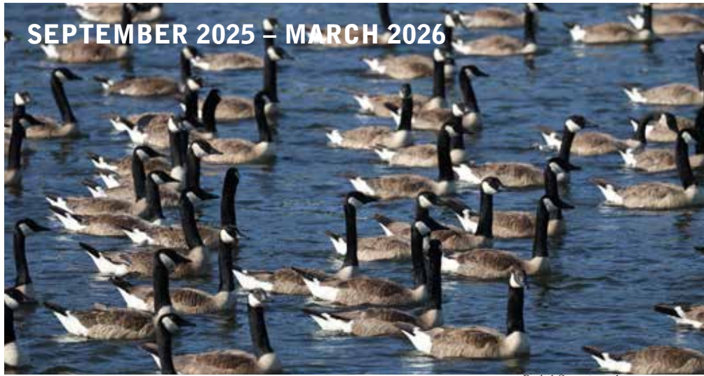
Rachel Cummings photo